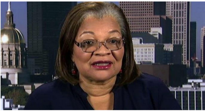
Alveda King is the niece of civil rights hero Martin Luther King, Jr.