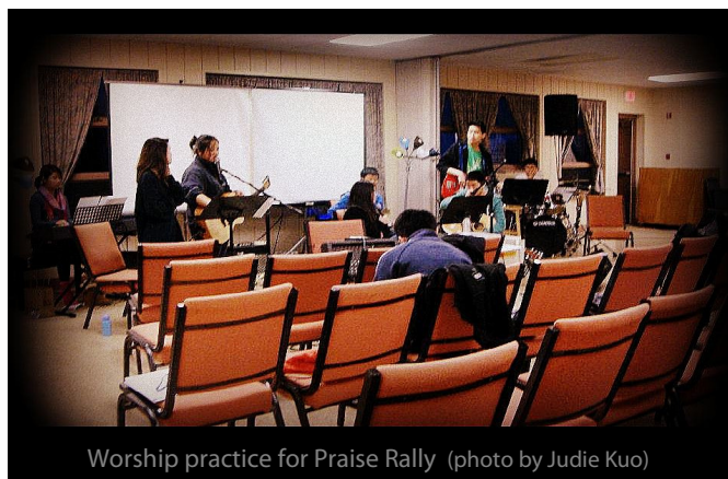
Worship practice for Praise Rally