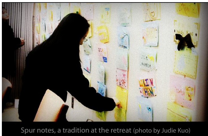
Spur notes, a tradition at the retreat

On the night of January 20, 2012, junior and senior high students eagerly gathered at Skycroft Conference Center in northern Maryland for the annual Winter Retreat. Every winter, students look forward to a relaxing weekend away from home where they have the opportunity to spend time with counselors and friends, meet new people, and challenge their faith through messages and workshops. Despite the freezing cold weather and the snowfall Friday night, students and counselors alike warmed their hearts with fellowship in Christ.